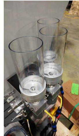
New batch blender conversion from 4 to 6 components